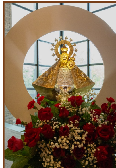
Our Lady of Peñafrancia, a popular Filipino Marian devotion.