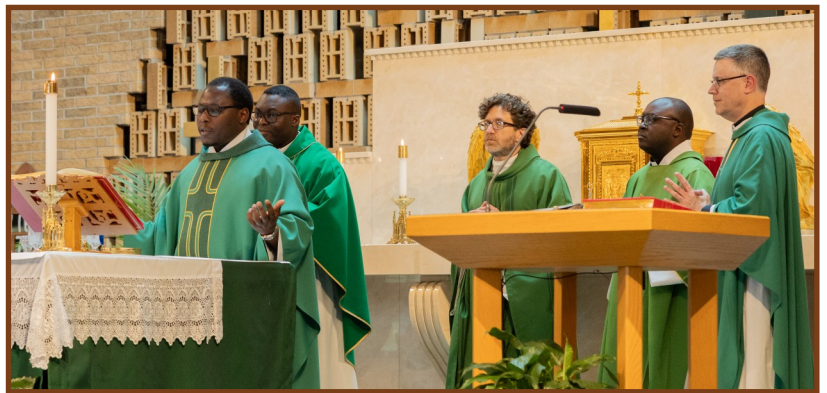
Celebration of Mass at St. Thérèse, Little Flower Parish, South Bend, Indiana, USA, September 6, 2025.

Fast-forward to 2025: as Family Rosary USA prepared for the Notre Dame Rosary Rally on September 7—commemorating the 75th anniversary of Father Peyton’s Rosary rally at his alma mater—God’s