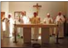
Mass at the Father Peyton Center in North Easton.

Please remember my special intentions when you gather daily to pray the Rosary and celebrate Mass at the Chapel of Our Lady of the Most Holy Rosary.