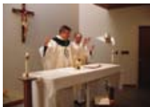
Mass at the Father Peyton Center in North Easton.

Please remember my special intentions when you gather daily to pray the Rosary and celebrate Mass at the Chapel of Our Lady of the Most Holy Rosary.