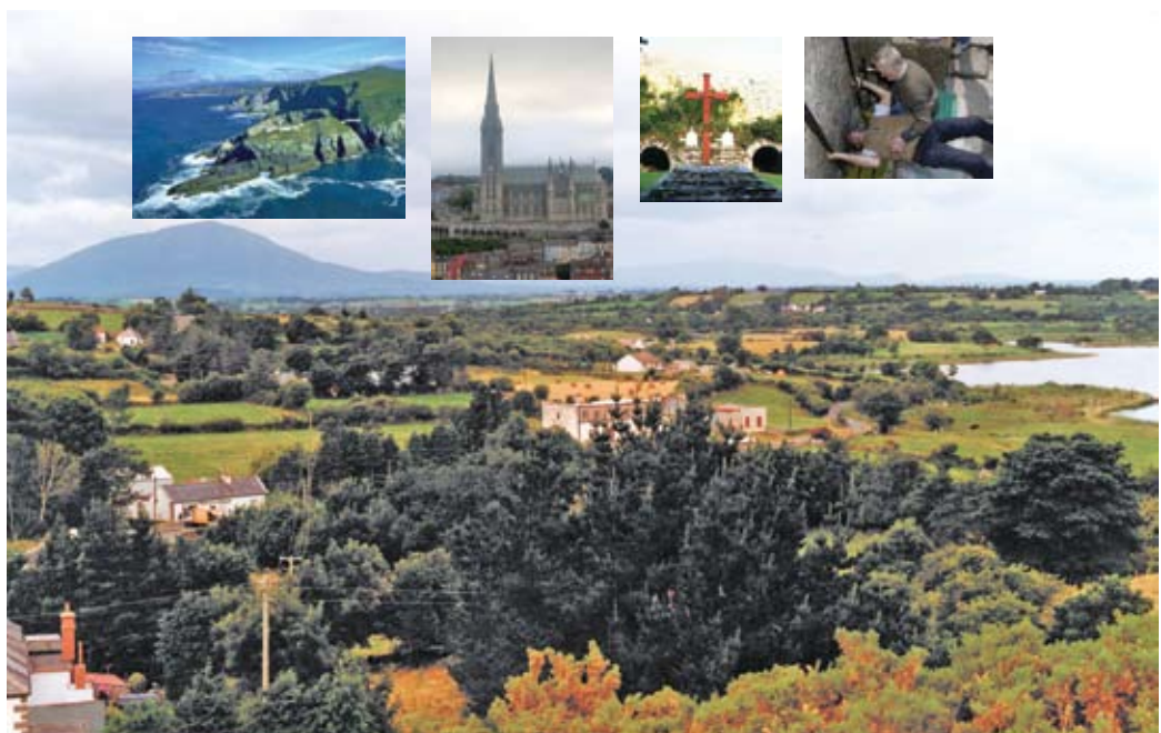
At Right: View of Attymass, in County Mayo, location of the Father Patrick Peyton CSC Memorial Centre. Insets: Mizen Head, St. Colman's Cathedral, St. Finbarr Retreat, the Blarney Stone.