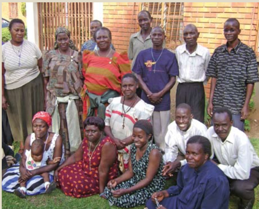
Guild members gather in Nsambya parish.